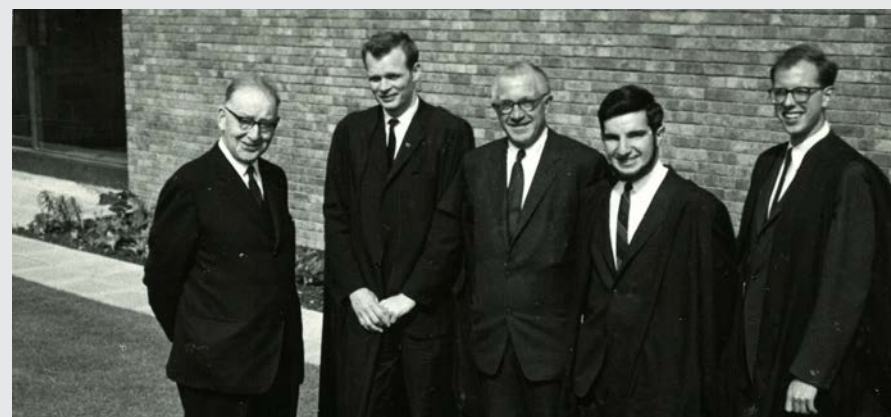
1963 the first Churchill Scholars arrive

The College is extremely grateful for the Foundation's ongoing support and we look forward to welcoming many more successful applicants in the future.