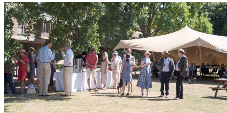
Donors enjoying the exclusive biennial Donor Garden Party in July 2022

1963 year group with highest % participation for giving