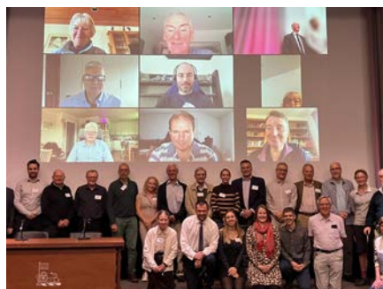
The inaugural meeting of Year Group Reps

This Donor Report recognises the incredible warmth shown to the College by the Churchill community. As well as financial support through life-time donations and legacy giving, the Churchill community also offers support by sponsoring events and volunteering their time: 52 cohorts now have a Year Group Representative. Thank you to the alumni who have offered to help the College keep in touch with alumni from their year, suggest ways to best foster relationships with alumni, and provide feedback on the College's plans for alumni and fundraising initiatives. More details can be found by visiting www.chu.cam.ac.uk/alumni-and-supporters/churchill-college-association . The inaugural meeting during the 2023 Association Weekend was tremendous, with 47 Year Group Reps from across the decades in attendance, 36 in person and 11 online. Senior College Officers including the Master and the Bursar also attended, and topics under discussion included the College's sustainability goals, a breakdown of the College's current financial position and forthcoming Reunion Dinners.