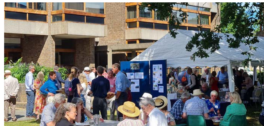
2022 Donor Garden Party

I am pleased to let you know that the eagerly-anticipated and generously-supported Bill Brown Creative Workshops will be soft opening this summer. The discovery of a store of rubble including asbestos-contamination under the workshops took some time to remove safely and delayed the project, but we are now looking forward to an official opening. We will be celebrating the space being ready for the 2024 Michaelmas term, as the first students arrive to study for the University's new Design Tripos (MDes). In addition to the traditional teaching methods at Cambridge, studios and workshops are going to be central to the new Design Tripos course. The programme is aiming to provide opportunities for students to develop and demonstrate knowledge and understanding, qualities, skills, and other attributes in the context of creative interdisciplinary design. Thanks to your donations, the digital fabrication room, VR room and project room in the Bill Brown Creative Workshops will provide the environment needed for these sorts of endeavours to flourish.